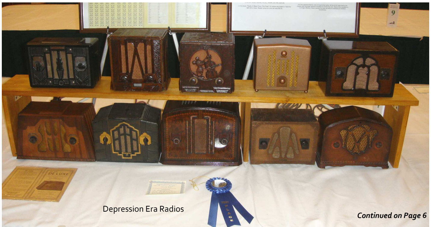
Depression Era Radios