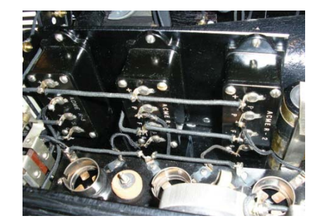
Acme R-3, Acme R-2 and Acme R-2 RF Transformers