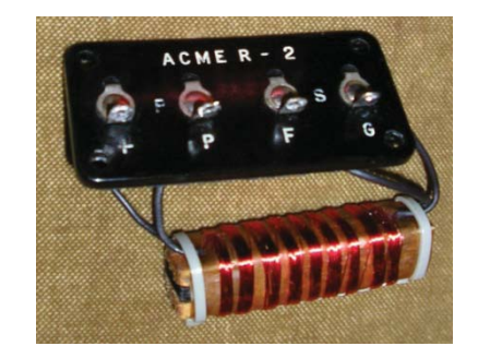
Re-wound Acme R-2 Transformer

With that problem solved the radio began to work and I decided to perform some tests in order to try to determine if the batteries were the problem and also see how long they would last. I assumed that the batteries could be the problem because of a statement in an article about this radio that read "... they only lasted a few minutes."