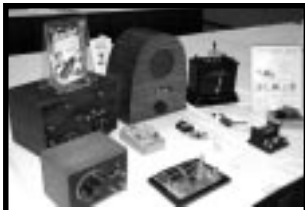
Paul Tucker's crystal radios