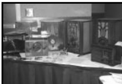
George Potter's Exhibit of Texas Radios