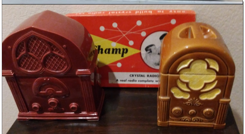
CONVENTION DOOR PRIZES (3): (Must be present at banquet to win)